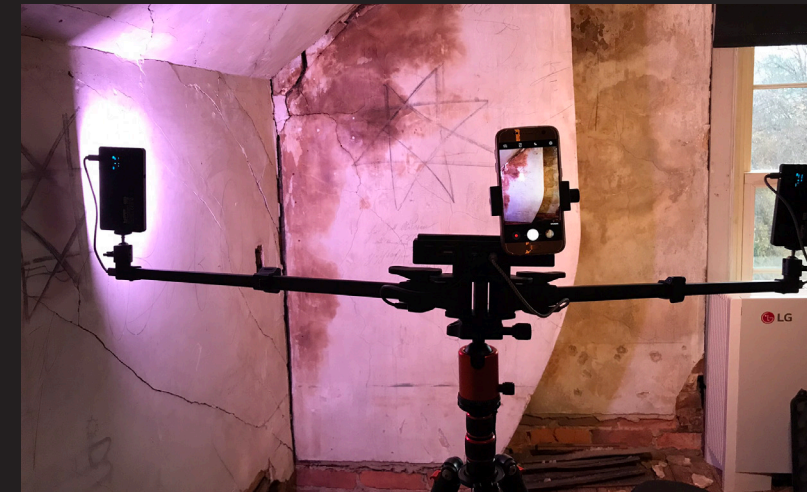
Multispectral imaging work at Historic Blenheim in Fairfax, Va